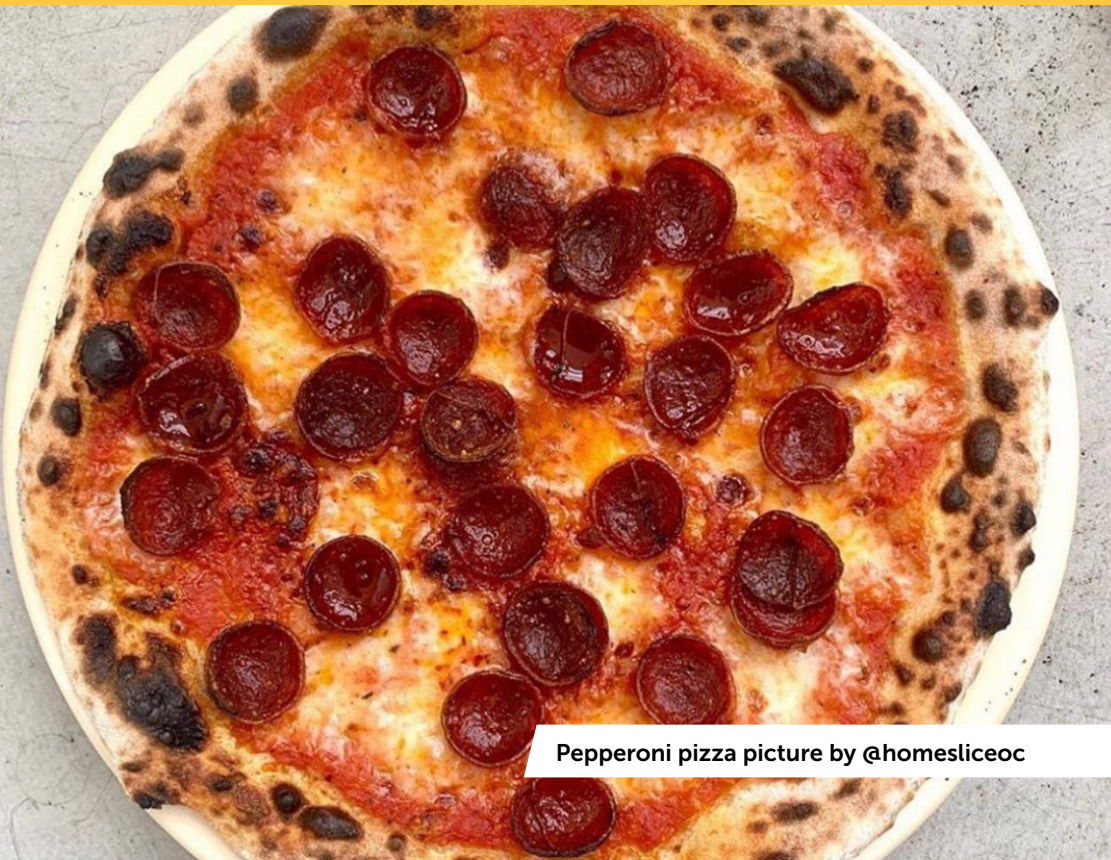
Pepperoni pizza