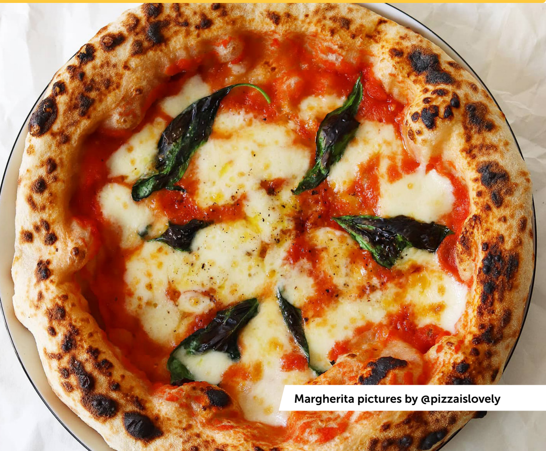
Margherita pictures by @pizzaislovely

2oz (56.6g) mozzarella, torn into pieces