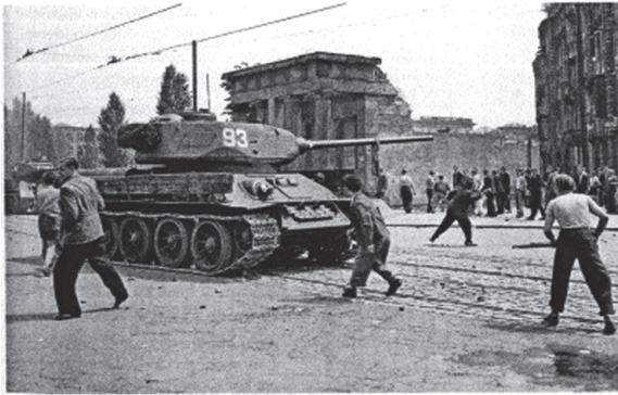
Doc. 4 Le 17 juin 1953 à Berlin-Est (RDA), sur la Stalinallee.

Le 16 juin 1953, les ouvriers entrent en grève contre une augmentation des normes de production dictée par l'État. Le 17 juin, la grève se transforme en révolte populaire qui culmine avec la revendication d'élections libres. La répression soviétique fait plusieurs centaines de morts et plus de 1 000 blessés.