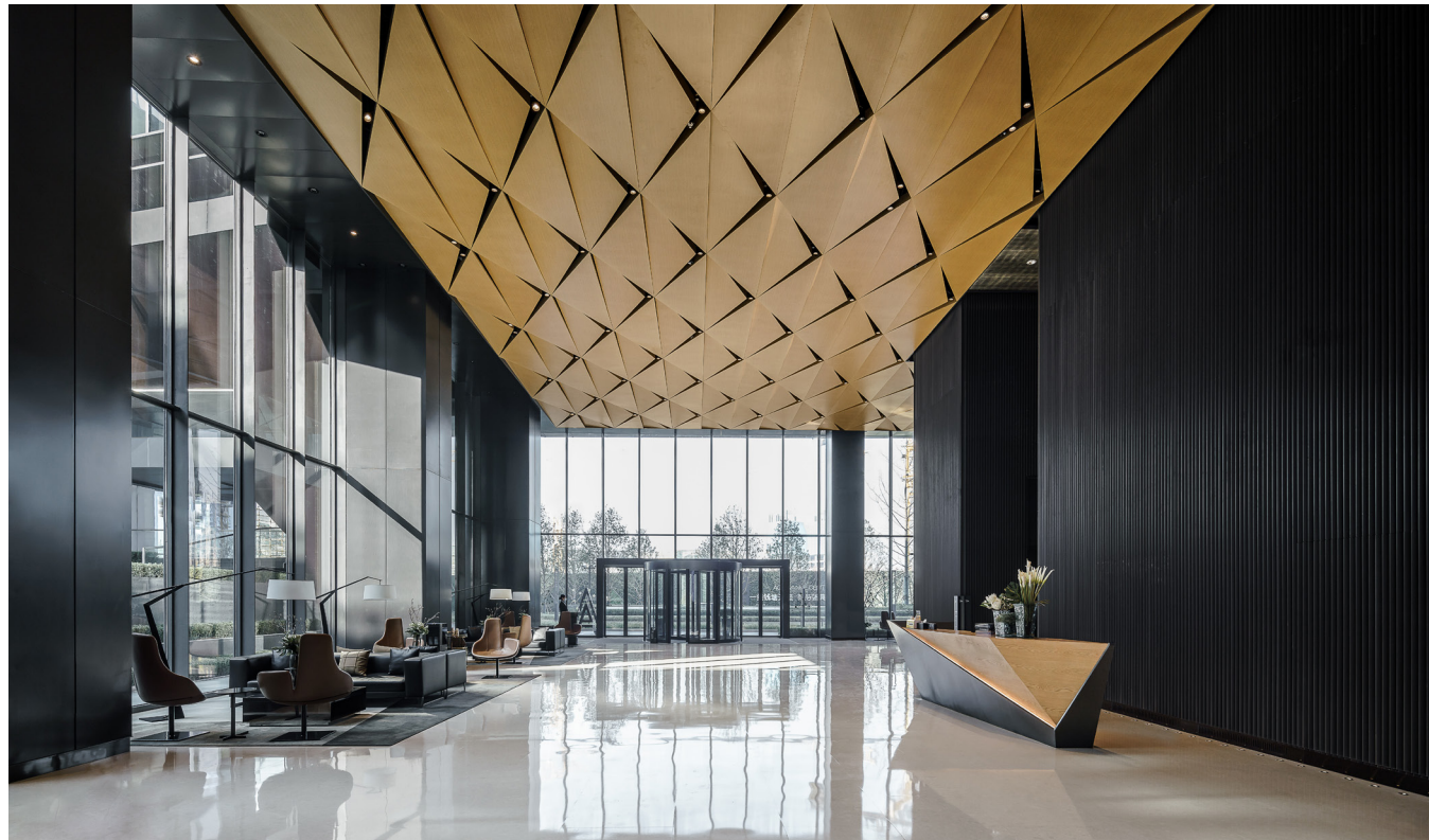
The interior of lobby area