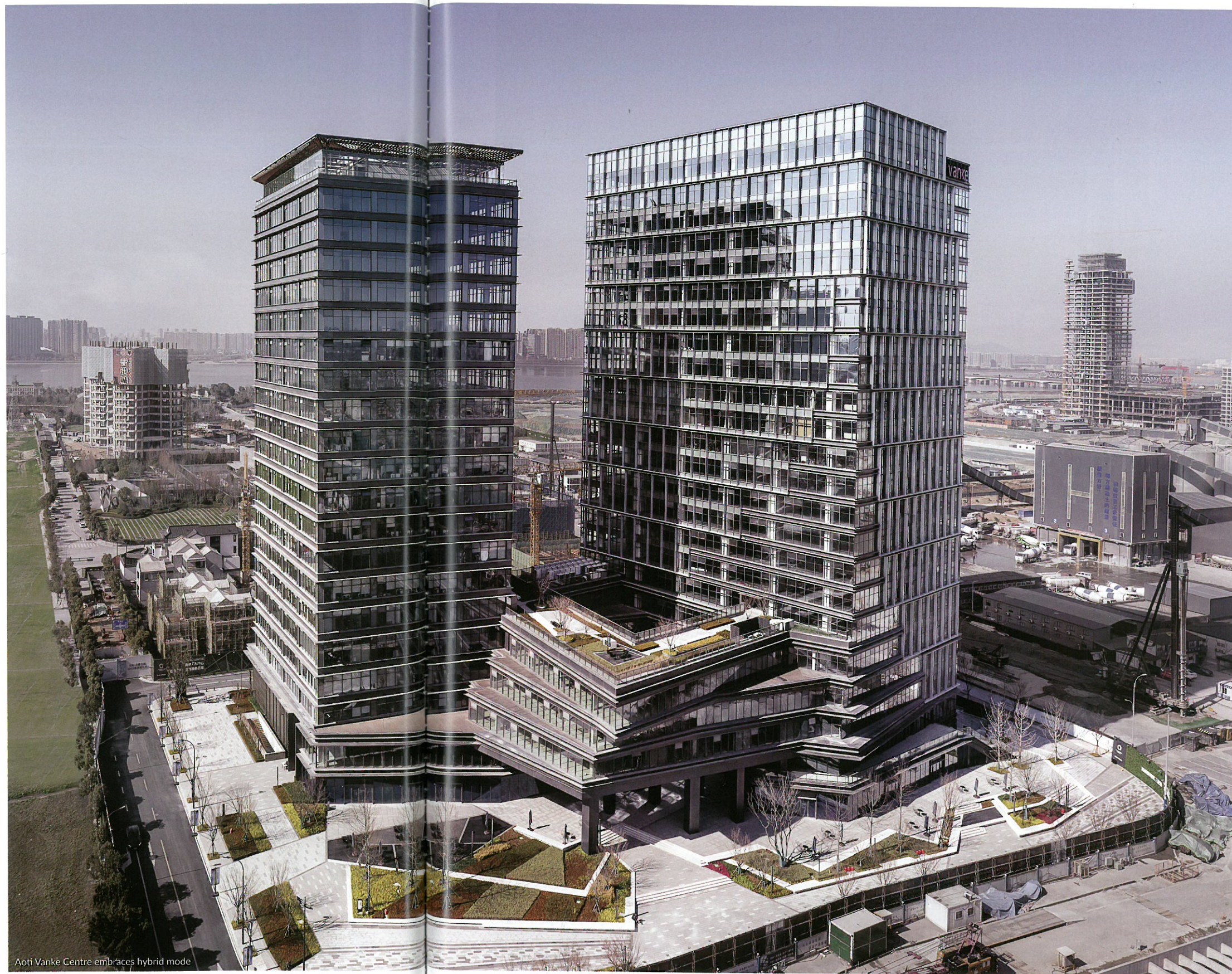
Aoti Vanke Centre embraces hybrid mode

The ring-shaped podium is lifted off the ground to create a central courtyard, while the semi-public podium roof garden serves as a bridge between the two towers, promoting symbiosis and creating networking occasions for building users. It also allows the passing through of a double-height covered outdoor space, as well as providing a north-south shortcut across the longitudinal site. This operative subdivision of the lot brings down the development to a human scale, experienced and enjoyed by the building users and pedestrians at large.