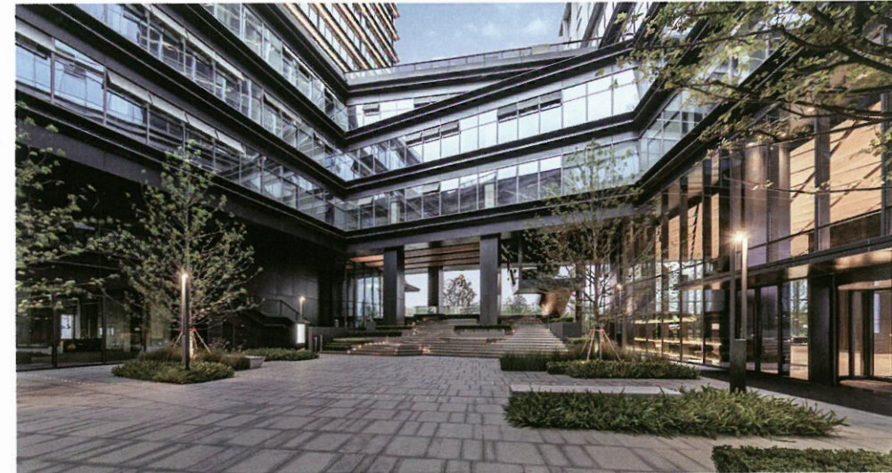
Nature-oriented equilibrium between the architecture and landscape