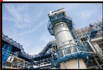
CHEMICALS & REFINING

Heavy duty HESI spark Igniters offer an astounding 24-Joules of spark energy. Uses and applications for these are for the hardest-to-ignite pulverized solid fuels and heavy bunker oils. With this much energy, moisture and ash have no effect on spark performance and this actually benefits as a self-cleaning spark tip!