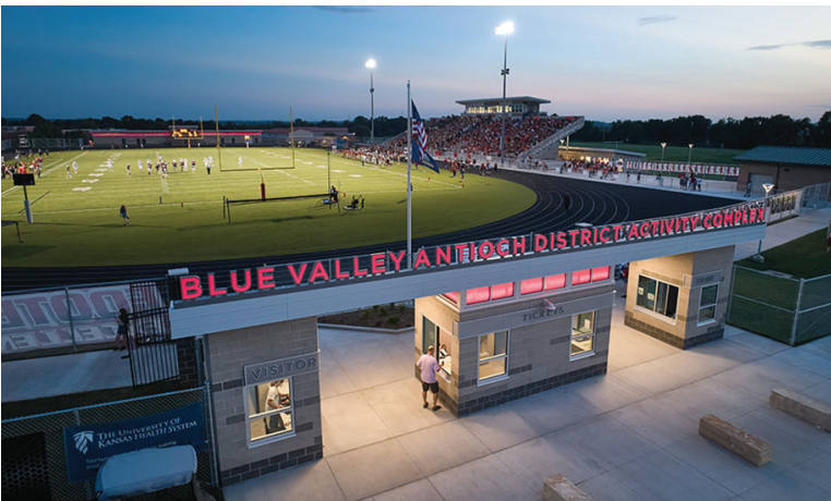
Blue Valley Antioch District Activity Complex.

Blue Valley School District enlisted JE Dunn to complete more than 30 projects by summer 2023 to meet its immediate needs. Among these are improvements to 35 schools and five administration buildings with the goal of reinvesting in aging facilities, upgrading technology, and providing a superior learning environment for students.