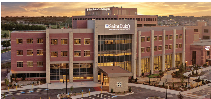
Saint Luke’s Rehabilitation Institute at Saint Luke’s South Hospital.