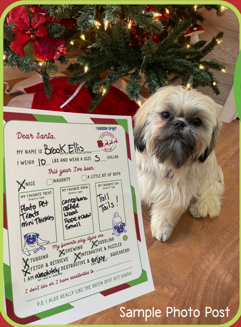
Sample Photo Post

SEND A LETTER & SNAP A PIC FOR A CHANCE TO WIN A $100 GIFT CARD!