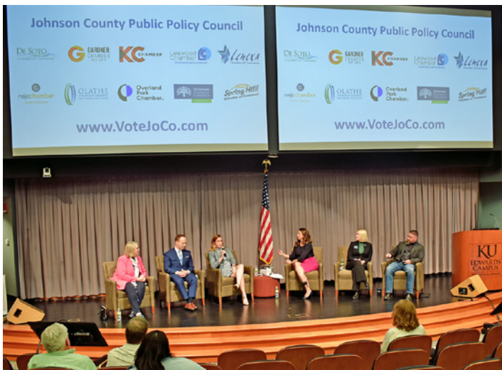
Six Johnson County legislators participated in a First Adjournment panel discussion presented last month by the chambers of commerce that comprise the Johnson County Public Policy Council.