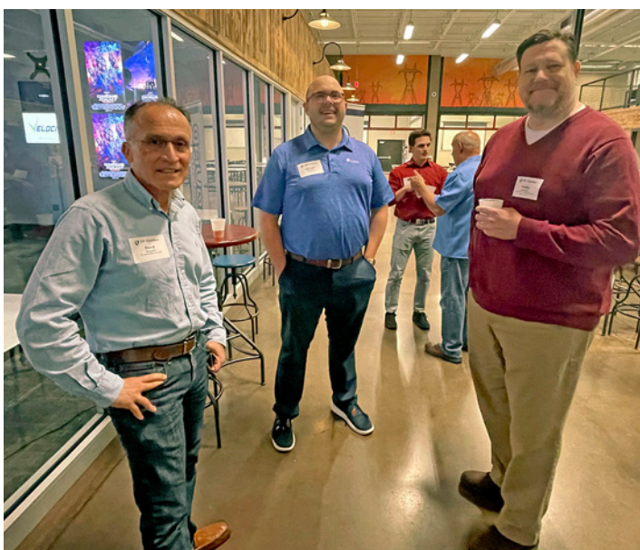
Chamber members enjoyed drinks and food from Tacos 4 Life while networking at OP After Hours hosted last month by GRID Collaborative Workspaces .