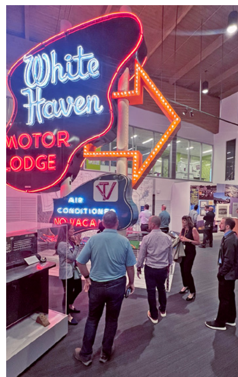
Class members toured the Johnson County Museum.