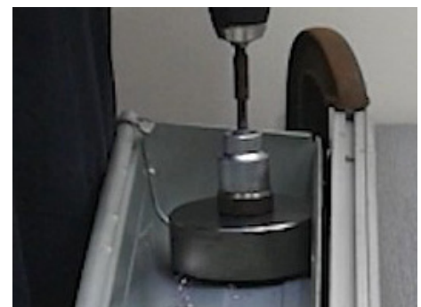
2. Position the punch, die and stud, then tighten the stud screw using a 1-inch socket, driven by a manual or battery wrench.