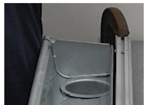
3. Insert the POP — and that's it!