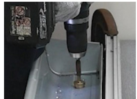
1. Drill the guide hole using a step drill.