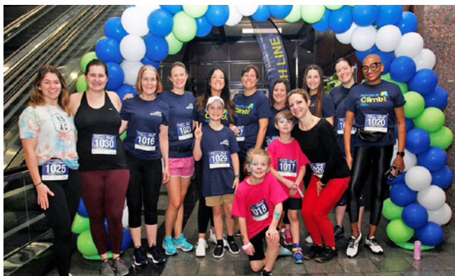
Empower employees participated in the American Lung Association's Fight For Air Climb Kansas City.