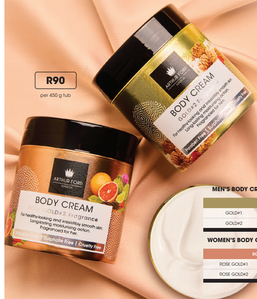
MEN'S BODY CREAM VARIANTS 450 g