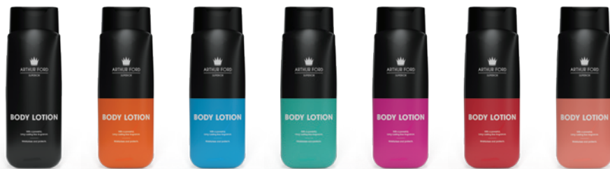
BODY LOTIONS MEN'S VARIANTS 400 ml