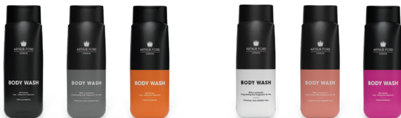
BODY WASH MEN'S VARIANTS 400 ml