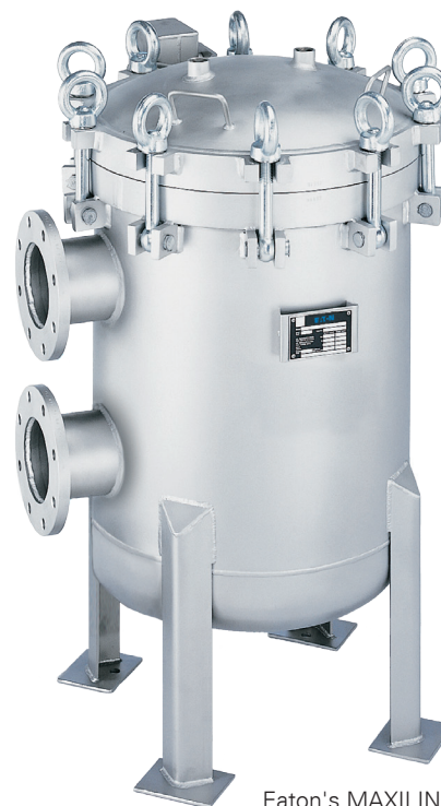
Eaton's MAXILINE MBF HE Bag Filter Housing