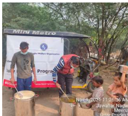
Nov 9, 2021 11:26:36 AM Jawahar Nagar Meerut Uttar Pradesh