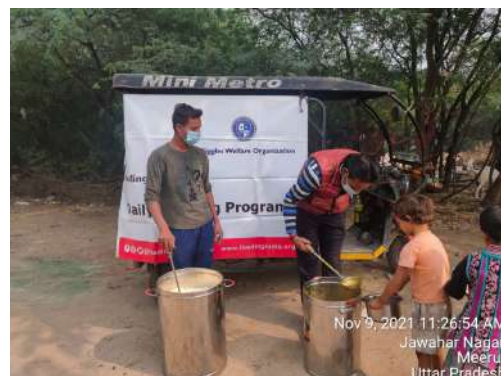
Nov 9, 2021 11:26:54 AM Jawahar Nagar Meerut Uttar Pradesh