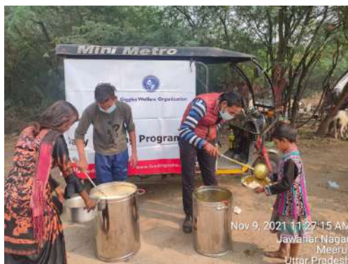
Nov 9, 2021 11:27:15 AM Jawahar Nagar Meerut Uttar Pradesh