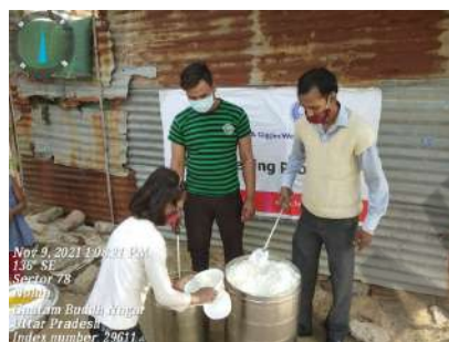
Nov 9, 2021 1:08:31 PM 130 SE Sector 78 Noida Gautam Buddha Nagar Uttar Pradesh Index number : 29614