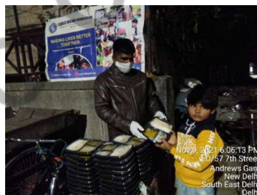
Nov 9, 2021 6:06:13 PM D/57 7th Street Andrews Ganj New Delhi South East Delhi Delhi