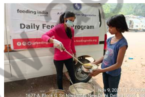
Nov 9, 2021 11:56:52 AM 1677-A, Block G, Sri Niwaspur, New Delhi, Delhi 110065, India