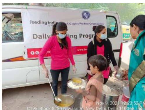
Nov 9, 2021 12:23:52 PM C195, Block G, Sri Niwaspur, New Delhi, Delhi 110065, India