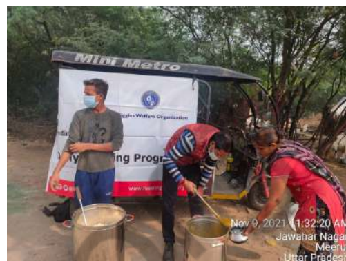
Nov 9, 2021 11:32:20 AM Jawahar Nagar Meerut Uttar Pradesh