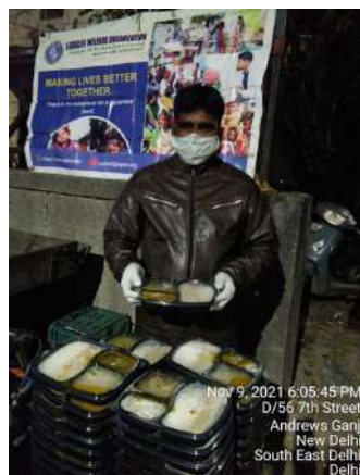
Nov 9, 2021 6:05:45 PM D/56 7th Street Andrews Ganj New Delhi South East Delhi Delhi