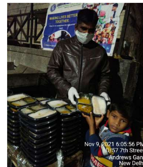
Nov 9, 2021 6:05:56 PM D/57 7th Street Andrews Ganj New Delhi South East Delhi Delhi