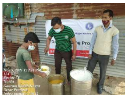
Nov 9, 2021 1:12:24 PM 124 SE Sector 78 Noida Gautam Buddha Nagar Uttar Pradesh Index number : 29615