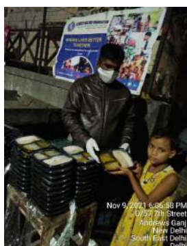
Nov 9, 2021 6:06:38 PM D/57 7th Street Andrews Ganj New Delhi South East Delhi Delhi