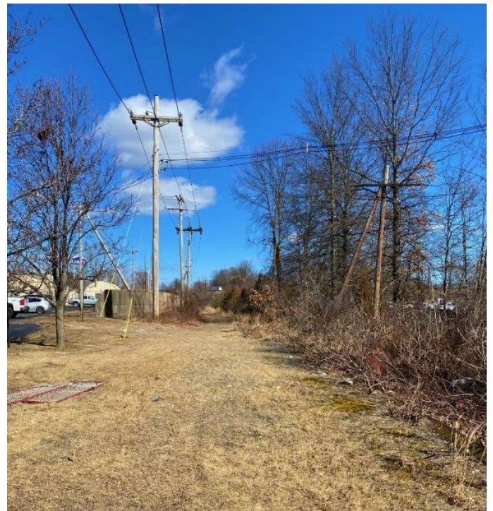
Pathway along the Gervais property, which goes from Cross Point Tower to the Target parking area, would become part of the Connector Trail

Progress is being made on plans to extend the BFRT into Lowell by way of the Connector Trail. This trail will start at the northern end of the BFRT, cross the parking lot of Cross Point Tower, and go along the Gervais car dealership on the railroad ROW, up to the Target parking area. From there it will follow city streets to connect to the Concord River Greenway.