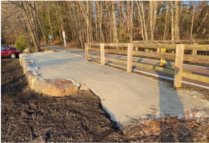
Site for the new kiosk adjacent to the BFRT at Pond Street