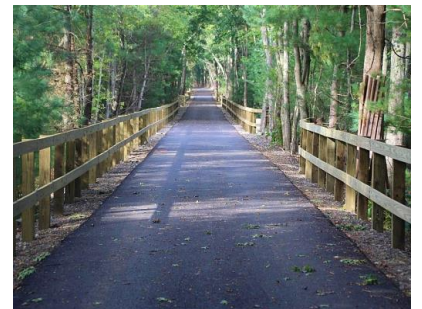
Construction of the BFRT in Sudbury will transform this undeveloped section of the right of way in Sudbury (top) into a paved trail similar to this section of the BFRT in Concord (bottom)