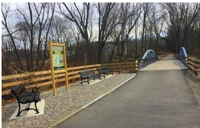
View of the BFRT rest area near the Assabet River in Concord