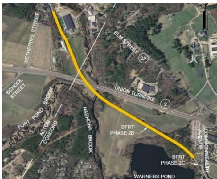
Mass DOT map of Phase 2B