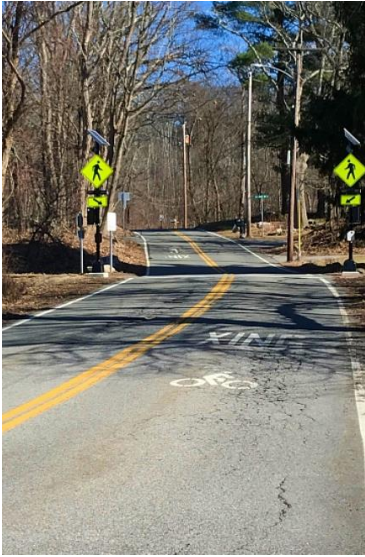
View from High Street showing the newly installed Rapid Rectangular Flashing Beacons