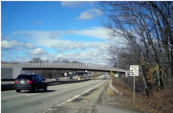
MassDOT rendering of the 300-foot bridge to be constructed over Rte. 2

The contract for BFRT Phase 2B construction, including the 300-foot bridge over Rte. 2, has been awarded to MIG Corporation in Acton. This long-awaited link between Acton (Phase 2A) and Concord (Phase 2C) will soon become a reality. This section of the trail will run from near Wetherbee Street in Acton to the small parking area near Commonwealth Avenue in Concord. It will also provide access to the Gerow Park recreation area on Warner's Pond.