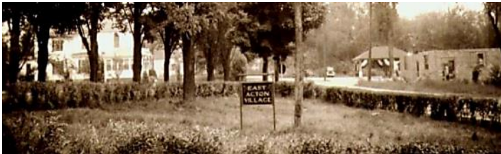
East Acton Village shown sometime prior to the widening of Great Road with Bursaw Gas and Oil in the background

This small parcel of land is situated at the heart of historic East Acton Village and was once the hub of a vibrant community with a railroad depot, telegraph poles (standing to this day), and Ice House Pond, where Yankee entrepreneurs cut and shipped giant blocks of ice by wagon and railroad to insulated clipper ships in Boston.