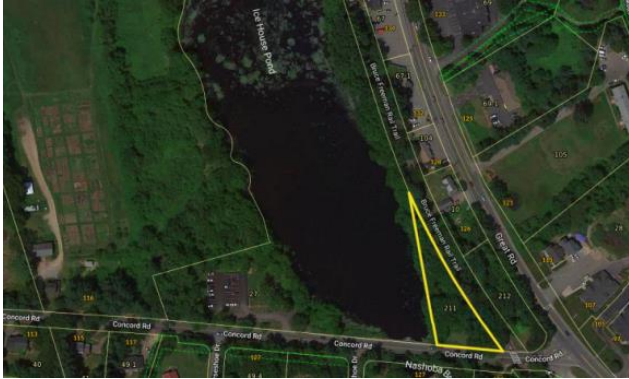
Map showing the area to be developed as the East Acton Village Green

The proposed East Acton Village Green (EAVG), a small park located at the corner of Town-owned land between Ice House Pond, Concord Road, and Great Road (Route 2A) and bisected by the BFRT, is on track for construction this year. Spring Town Meeting is being asked to approve construction of EAVG and appropriate $49,802 from CPA funds to do so. A favorable vote is the last major remaining hurdle to overcome.