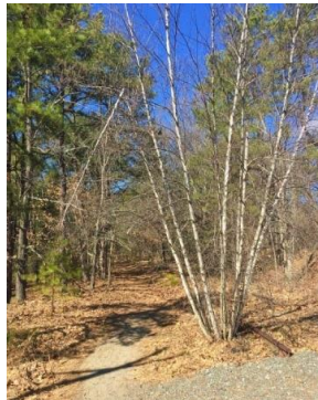
The undeveloped section of Phase 2B, looking north from the terminus of Phase 2C in Concord. The old rails are visible in the lower right.

Plans for Phase 2B are available here: bit.ly/2B-info .