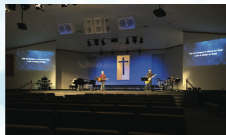
Recording our Services - No Crowd