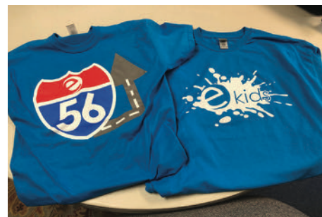
New eKids Volunteer Shirts.