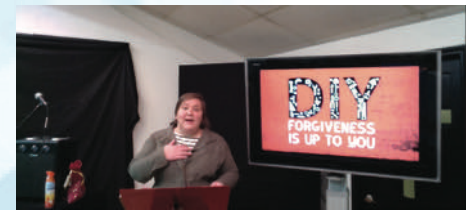
eKids and e56 Filming for Online Services