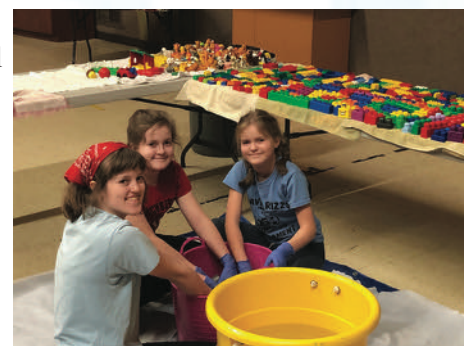
Deep Cleaning the Nursery Toys