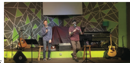
Student Ministry Filming for Online Youth Services