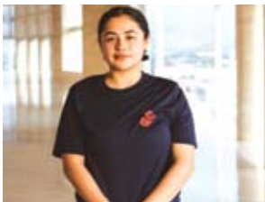
First Woman Lakewood resident first to train at San Diego USMC. Page 7.