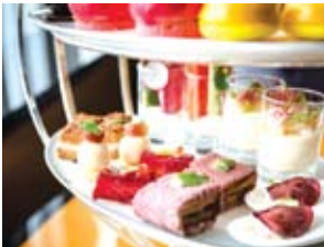
Mother's Day Bower's Tangata and get free admission to museum. Page 9.