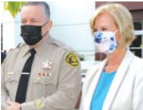
Cerritos Vaccinates 1,000 people got a vaccine at the Civic Center. Page 2.