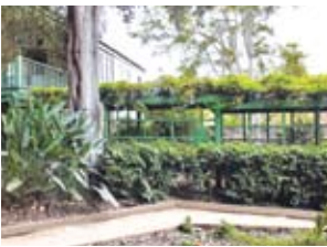
Wisteria Blooming Visit Rancho Los Cerritos and enjoy the outdoors. Page 16.