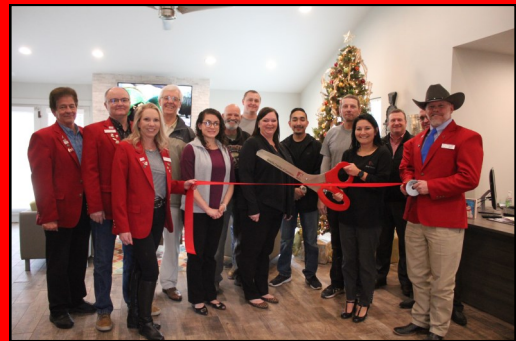
Rock Island Apartments 7101 Wolflin Ave.