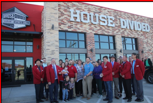
House Divided Restaurant & Sports Bar 7609 Hillside