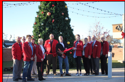
Wolflin Village Wolflin & Georgia