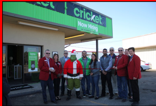
Optimal Wireless (Cricket Wireless) 1800 Bell