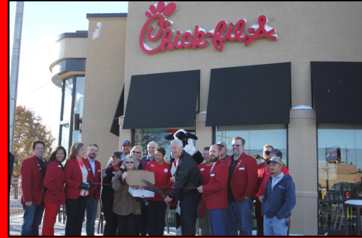
Chick-Fil-A 20th Anniversary 4510 S Coulter