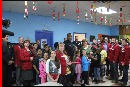
APD Neighborhood Police Officer Program at the Maverick Club—1923 S Lincoln