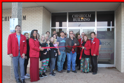
Unique Fitness Studio 1220 S Georgia, Suite B

Contact Christy at 342-2004 for information on holding your own Ribbon Cutting or Ground Breaking event.