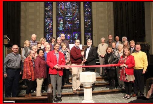
First Presbyterian Church 1100 S Harrison