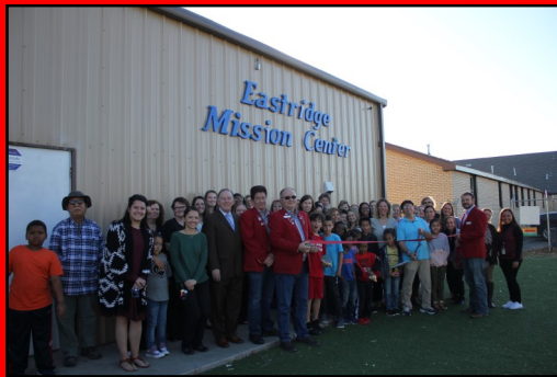
Eastridge Mission Center 1300 Evergreen