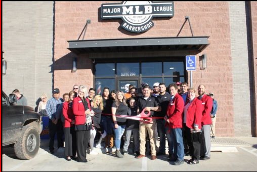
Amarillo's Major League Barbershop 6701 S Coulter, Suite 200

Click on http://bit.ly/RibbonCuttingsNovDec2018 to view or download these pictures.