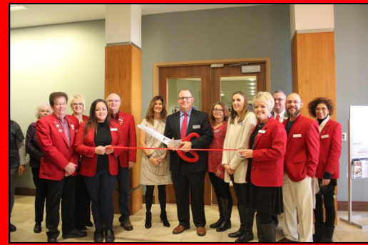
Harrington Cancer & Health Foundation Cancer Survivorship Center—6600 Killgore