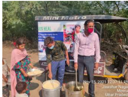
Nov 15, 2021 12:37:11 PM Jawahar Nagar Meerut Uttar Pradesh