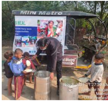
Nov 8, 2021 11:27:20 AM Jawahar Nagar Meerut Uttar Pradesh