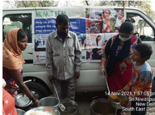
14-Nov-2021 1:57:05 pm Sri Niwasपुरी New Delhi South East Delhi Delhi