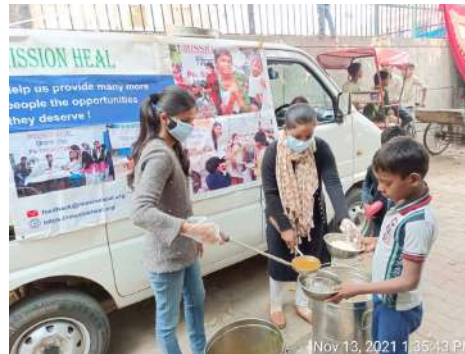
Nov 13, 2021 1:35:43 PM