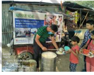
Sector 76 Noida Gautam Buddha Nagar Uttar Pradesh Index number: 9271 8 Nov 2021 1:59:33 p.m.