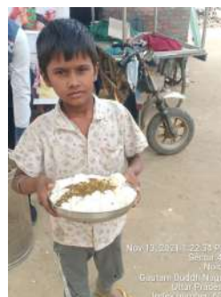
Nov 13, 2021 1:22:55 PM Sector 42 Noida Gautam Buddha Nagar Uttar Pradesh Index number: 602