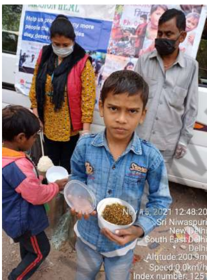
Nov 15, 2021 12:48:20 Sri Niwaspuri New Delhi South East Delhi Delhi Altitude: 200.9m Speed: 0.0km/h Index number: 1251