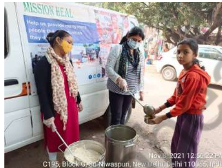
Nov 8, 2021 12:56:22 PM C195, Block G, Sri Niwaspur, New Delhi, Delhi 110065, India