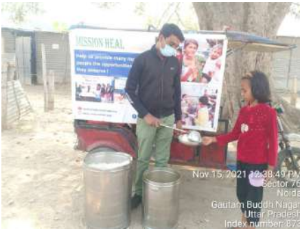
Nov 15, 2021 12:38:49 PM Sector 76 Noida Gautam Buddha Nagar Uttar Pradesh Index number: 873

Nothing is more heart-breaking than seeing hungry children