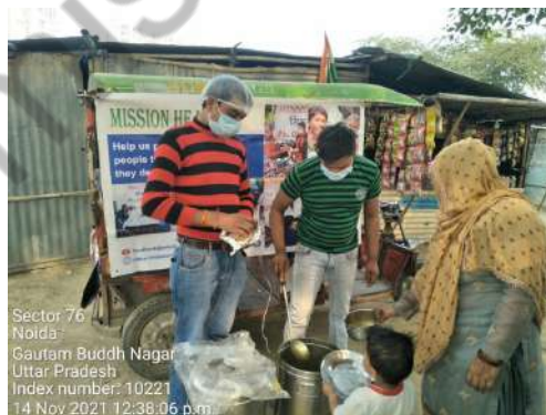
Sector 76 Noida Gautam Buddh Nagar Uttar Pradesh Index number: 10221 14 Nov 2021 12:38:06 p.m.