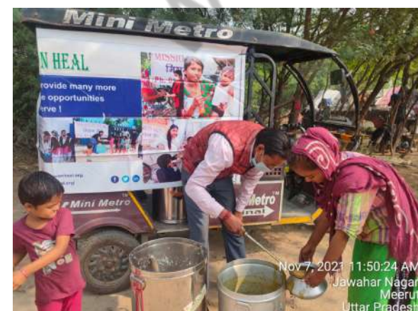
Nov 7, 2021 11:50:24 AM Jawahar Nagar Meerut Uttar Pradesh