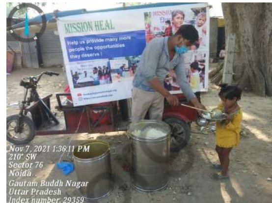
Nov 7, 2021 1:36:11 PM 210° SW Sector 76 Noida Gautam Buddh Nagar Uttar Pradesh Index number: 29359