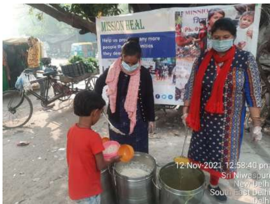
12-Nov-2021 12:58:40 pm Sri Niwaspur New Delhi South East Delhi