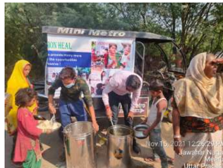
Nov 15, 2021 12:28:29 PM Jawahar Nagar Meerut Uttar Pradesh