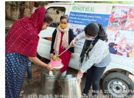
Nov 8, 2021 10:27:24 PM C195, Block G, Sri Niwaspur, New Delhi, Delhi 110065, India