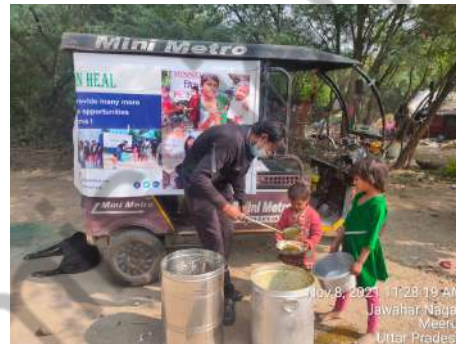
Nov 8, 2021 11:29:19 AM Jawahar Nagar Meerut Uttar Pradesh