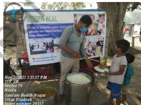
Nov 7, 2021 1:31:57 PM 219° SW Sector 76 Noida Gautam Buddh Nagar Uttar Pradesh Index number: 29317