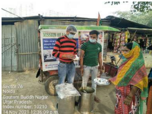
Sector 76 Noida Gautam Buddh Nagar Uttar Pradesh Index number: 10210 14 Nov 2021 12:36:09 p.m.