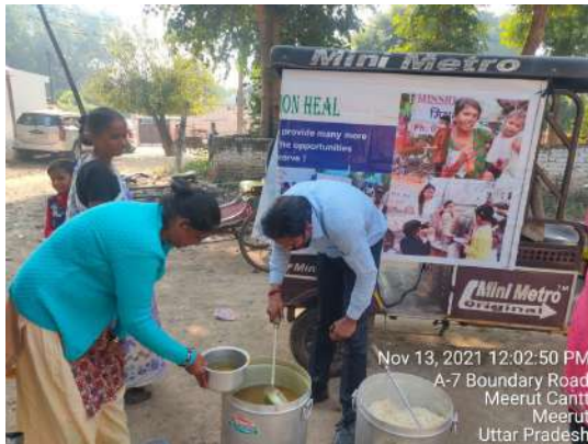
Nov 13, 2021 12:02:50 PM A-7 Boundary Road Meerut Cantt Meerut Uttar Pradesh