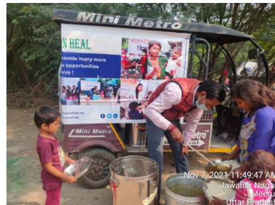
Nov 7, 2021 11:49:47 AM Jawahar Nagar Meerut Uttar Pradesh