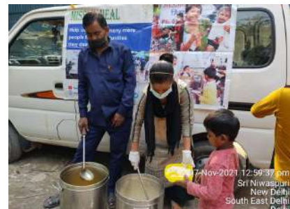
07-Nov-2021 12:59:37 pm Sri Niwaspur New Delhi South East Delhi Delhi