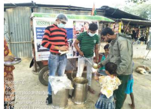
Sector 76 Noida Gautam Buddh Nagar Uttar Pradesh Index number: 10223 14 Nov 2021 12:38:20 p.m.