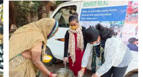
Nov 8, 2021 1:07:45 AM C195, Block G, Sri Niwaspur, New Delhi, Delhi 110065, India