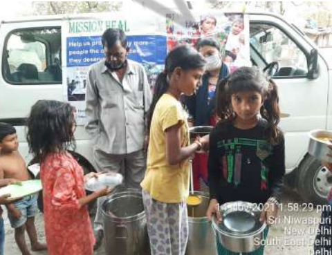
14-Nov-2021 1:58:29 pm Sri Niwasपुरी New Delhi South East Delhi Delhi