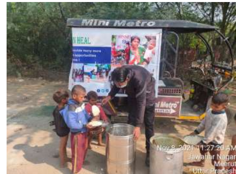
Nov 8, 2021 11:27:20 AM Jawahar Nagar Meerut Uttar Pradesh