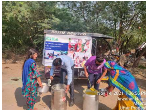
Nov 14, 2021 1:06:56 PM Jawahar Nagar Meerut Uttar Pradesh