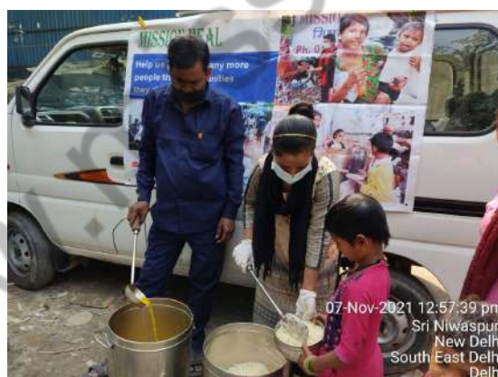
07-Nov-2021 12:57:39 pm Sri Niwaspur New Delhi South East Delhi Delhi