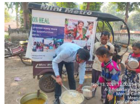
Nov 13, 2021 12:00:05 PM A-7 Boundary Road Meerut Cantt Meerut Uttar Pradesh