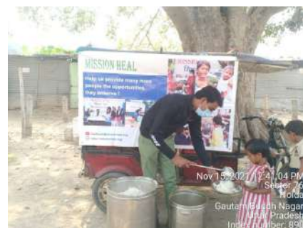
Nov 15, 2021 12:41:04 PM Sector 76 Noida Gautam Buddha Nagar Uttar Pradesh Index number: 890