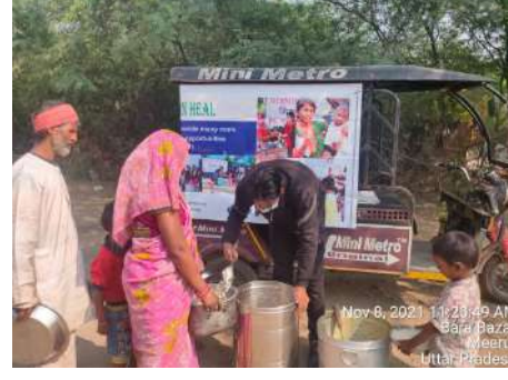
Nov 8, 2021 11:29:19 AM Bara Bazar Meerut Uttar Pradesh