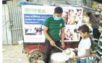
Sector 76 Noida Gautam Buddha Nagar Uttar Pradesh Index number: 9271 8 Nov 2021 1:59:33 p.m.