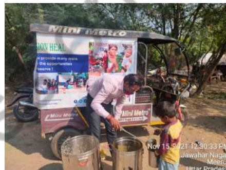
Nov 15, 2021 12:30:33 PM Jawahar Nagar Meerut Uttar Pradesh