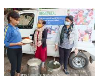
Nov 8, 2021 11:56:05 AM C195, Block G, Sri Niwaspur, New Delhi, Delhi 110065, India