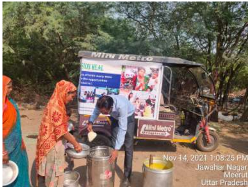
Nov 14, 2021 1:08:25 PM Jawahar Nagar Meerut Uttar Pradesh