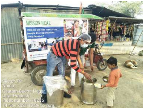
Sector 76 Noida Gautam Buddh Nagar Uttar Pradesh Index number: 10236 14 Nov 2021 12:39:53 p.m.