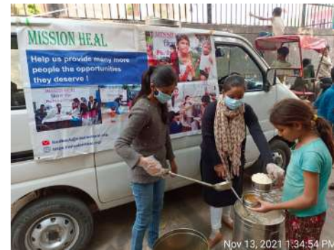
Nov 13, 2021 1:34:54 PM