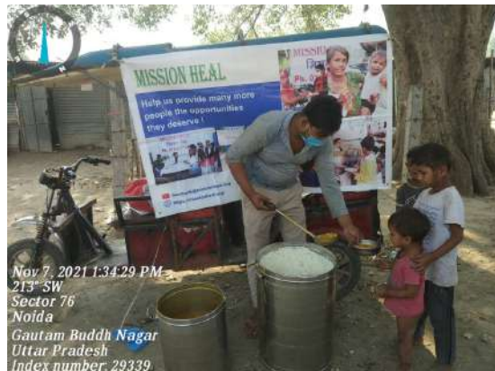
Nov 7, 2021 1:34:29 PM 213° SW Sector 76 Noida Gautam Buddh Nagar Uttar Pradesh Index number: 29339