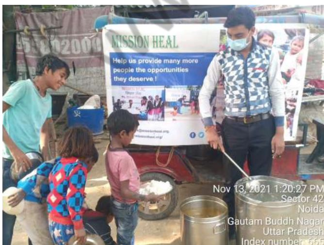
Nov 13, 2021 1:20:27 PM Sector 42 Noida Gautam Buddha Nagar Uttar Pradesh Index number: 655