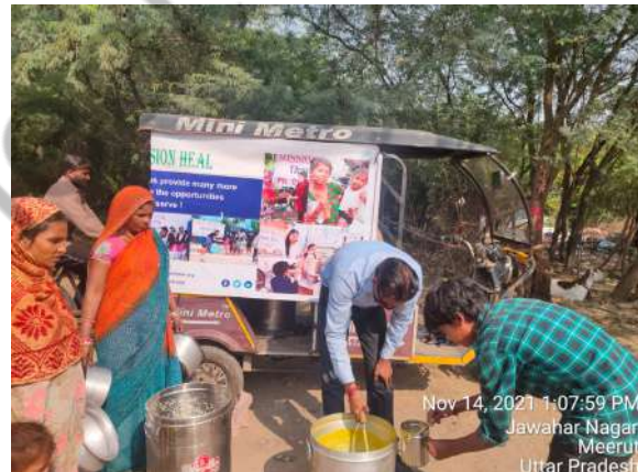
Nov 14, 2021 1:07:59 PM Jawahar Nagar Meerut Uttar Pradesh