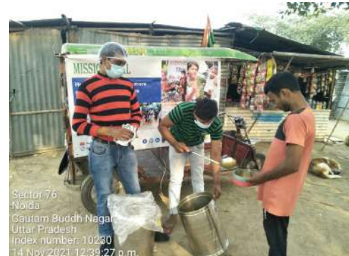
Sector 76 Noida Gautam Buddh Nagar Uttar Pradesh Index number: 10220 14 Nov 2021 12:39:27 p.m.