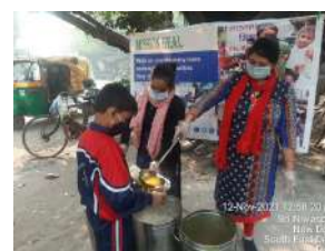
12-Nov-2021 12:58:20 pm Sri Niwaspur New Delhi South East Delhi