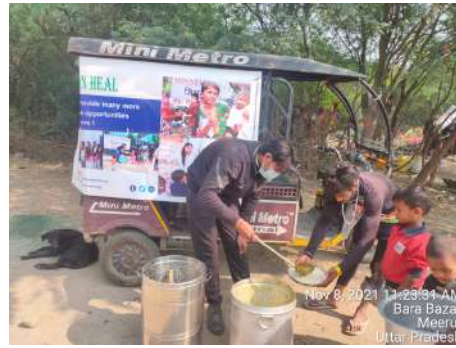
Nov 8, 2021 11:29:31 AM Bara Bazar Meerut Uttar Pradesh