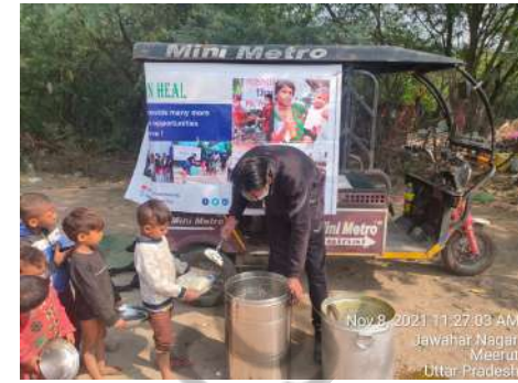
Nov 8, 2021 11:27:03 AM Jawahar Nagar Meerut Uttar Pradesh