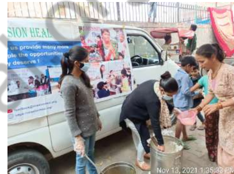
Nov 13, 2021 1:35:33 PM