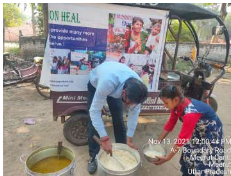
Nov 13, 2021 12:00:44 PM A-7 Boundary Road Meerut Cantt Meerut Uttar Pradesh