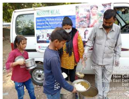
Nov 15, 2021 12:41:59 PM Sri Niwaspuri New Delhi South East Delhi Delhi Altitude: 203.1m Speed: 0.0km/h Index number: 1249