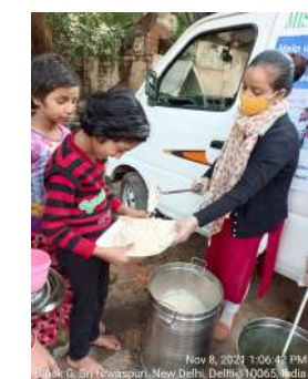
Nov 8, 2021 1:06:41 PM C195, Block G, Sri Niwaspur, New Delhi, Delhi 110065, India