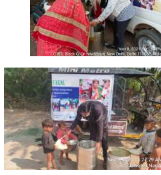
Nov 8, 2021 11:27:20 AM Jawahar Nagar Meerut Uttar Pradesh