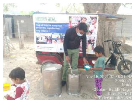
Nov 15, 2021 12:38:31 PM Sector 76 Noida Gautam Buddha Nagar Uttar Pradesh Index number: 870