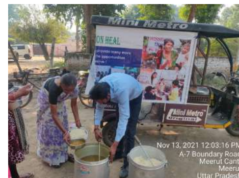
Nov 13, 2021 12:03:16 PM A-7 Boundary Road Meerut Cantt Meerut Uttar Pradesh