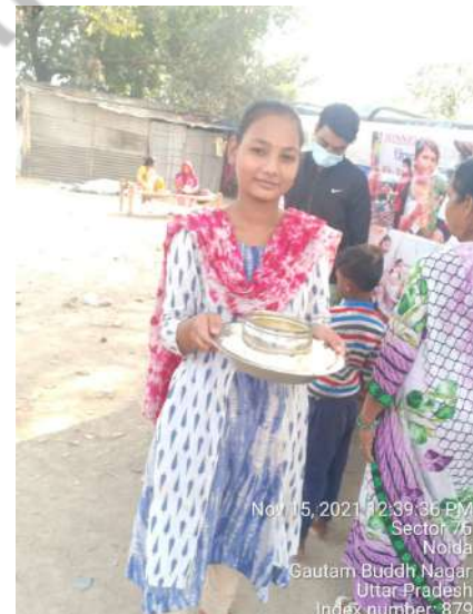
Nov 15, 2021 12:39:36 PM Sector 76 Noida Gautam Buddha Nagar Uttar Pradesh Index number: 879