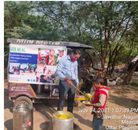
Nov 14, 2021 1:07:39 PM Jawahar Nagar Meerut Uttar Pradesh