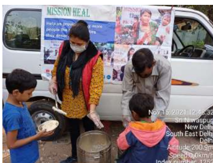
Nov 15, 2021 12:48:32 Sri Niwaspuri New Delhi South East Delhi Delhi Altitude: 200.9m Speed: 0.0km/h Index number: 1252