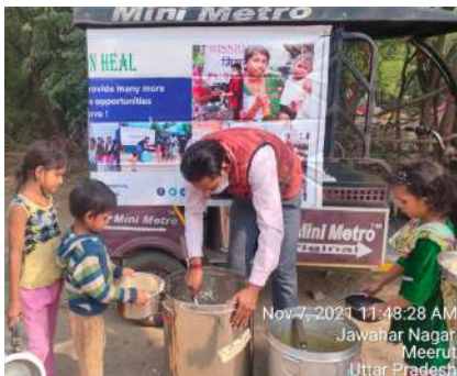
Nov 7, 2021 11:48:28 AM Jawahar Nagar Meerut Uttar Pradesh