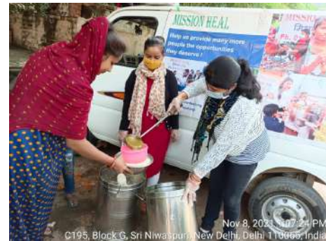
Nov 8, 2021 10:27:24 PM C195, Block G, Sri Niwaspur, New Delhi, Delhi 110065, India