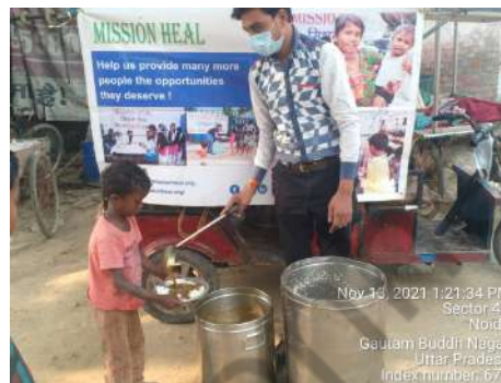
Nov 13, 2021 1:21:34 PM Sector 42 Noida Gautam Buddha Nagar Uttar Pradesh Index number: 675