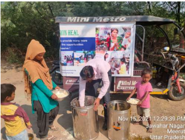
Nov 15, 2021 12:29:39 PM Jawahar Nagar Meerut Uttar Pradesh