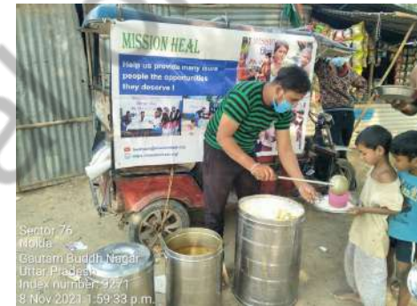
Sector 76 Noida Gautam Buddha Nagar Uttar Pradesh Index number: 9271 8 Nov 2021 1:59:33 p.m.