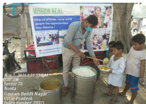
Nov 7, 2021 1:31:35 PM 220° SW Sector 76 Noida Gautam Buddh Nagar Uttar Pradesh Index number: 29315