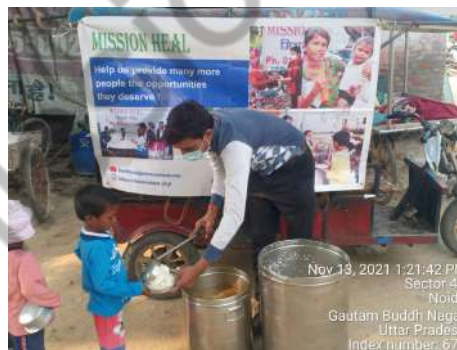
Nov 13, 2021 1:21:42 PM Sector 42 Noida Gautam Buddha Nagar Uttar Pradesh Index number: 676