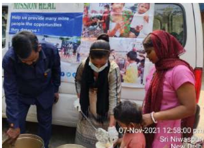
07-Nov-2021 12:58:00 pm Sri Niwaspur New Delhi