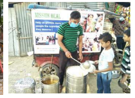
Sector 76 Noida Gautam Buddha Nagar Uttar Pradesh Index number: 9271 8 Nov 2021 1:59:33 p.m.