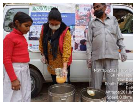
Nov 15, 2021 12:51:24 Sri Niwaspuri New Delhi South East Delhi Delhi Altitude: 201.8m Speed: 0.0km/h Index number: 1253