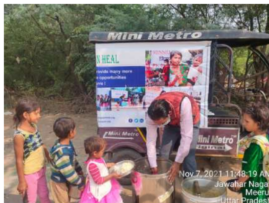
Nov 7, 2021 11:48:19 AM Jawahar Nagar Meerut Uttar Pradesh