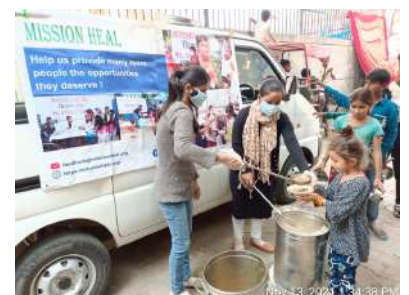
Nov 13, 2021 1:31:38 PM

C-63, Basement South Extentsion-2, Delhi-110049