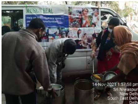
14-Nov-2021 1:57:58 pm Sri Niwasपुरी New Delhi South East Delhi Delhi