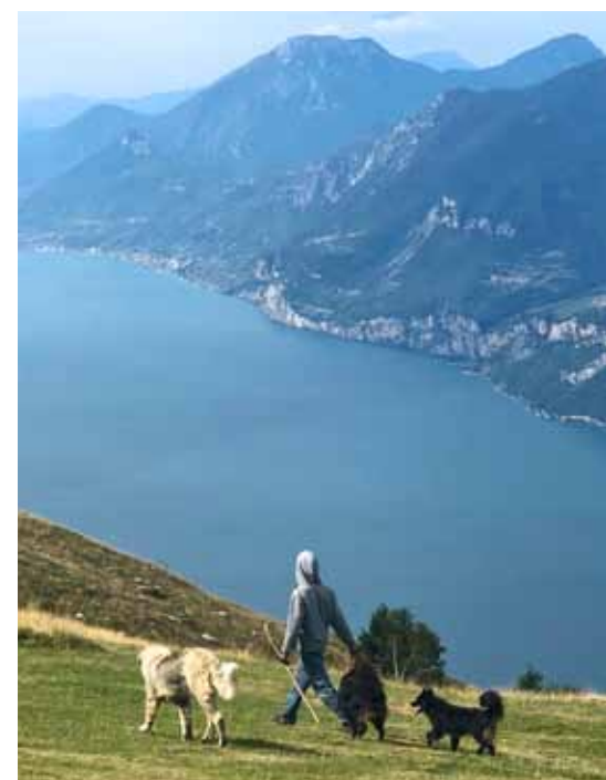
Monte Baldo Lake Garda, Italy

ITALIAN LAKES (14 DAYS) | BEGINS 26 SEPT. FROM LUZERN, SWITZERLAND / ENDS 9 OCT. 2024 | VERONA, ITALY