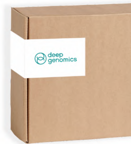
BRANDED BOX STICKER