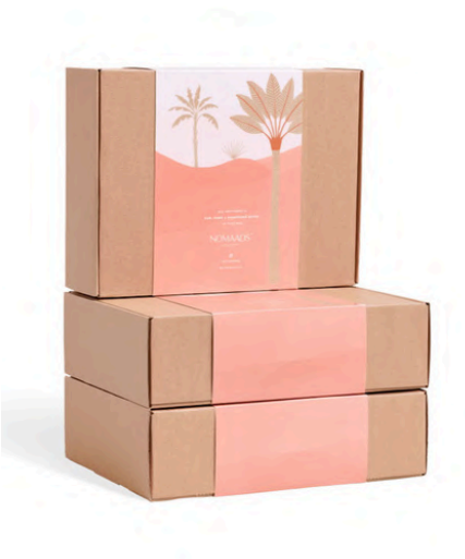
BRANDED BOX SLEEVE