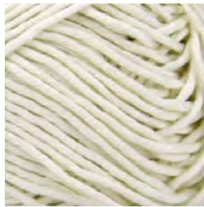
OFF WHITE - 433