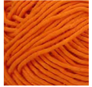
JAFFA - 420