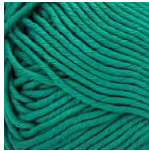
PEACOCK GREEN - 436