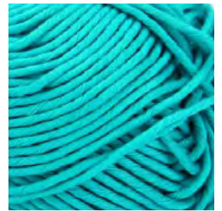
TEAL - 447