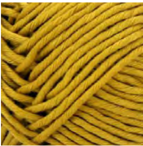
MUSTARD - 432