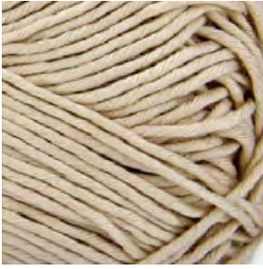
SKIN - 442