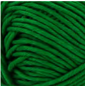
LEAF GREEN - 423