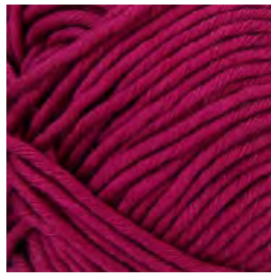
BOYSENBERRY - 406