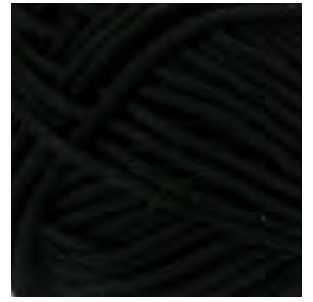
BLACK - 404