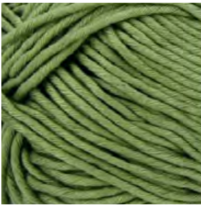
PALE GREEN - 435