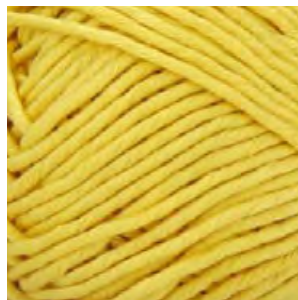
DANDELION - 414