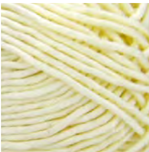
CREAM - 413