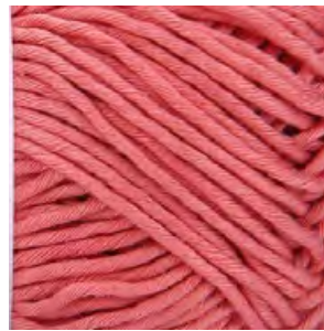
OLD ROSE - 434