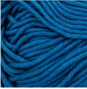
MARINE BLUE - 429