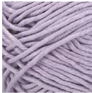
LAVENDAR - 422