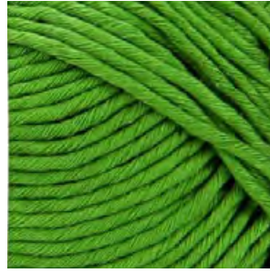
MEADOW - 430