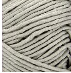
IVORY - 419