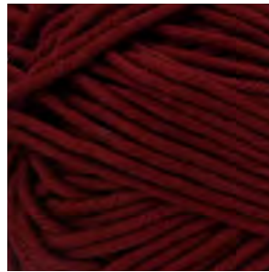
CLARET - 411