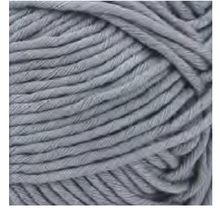
STONE - 445