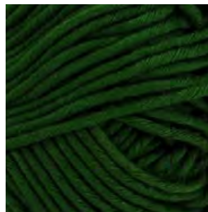
DARK GREEN - 415