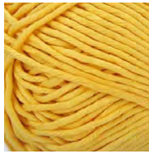
SUNSHINE - 446