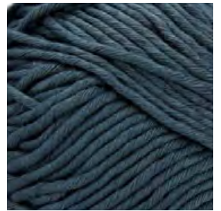
COOL GREY - 412