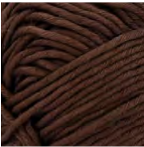
JUST BROWN - 421