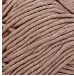
MOCHA - 431