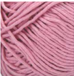
PRETTY PINK - 438