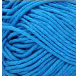
TURQUOISE - 448