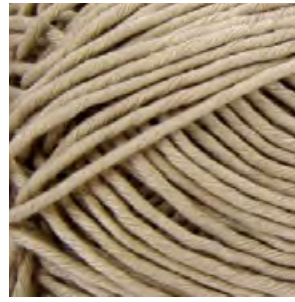
BEIGE POWDER - 403