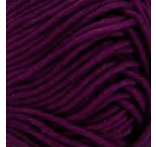
VIOLACEOUS - 449