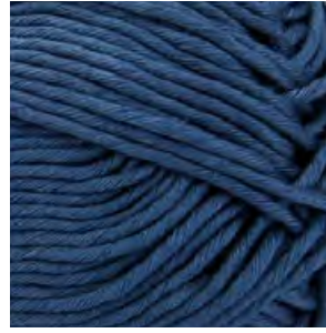
SMOKY BLUE - 444