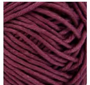
MAGNIFICENT MAUVE - 428