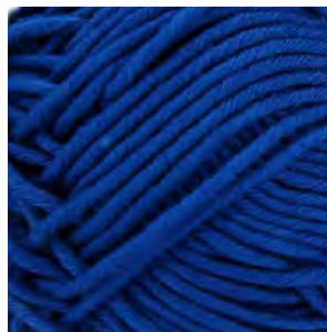
ROYAL BLUE - 439