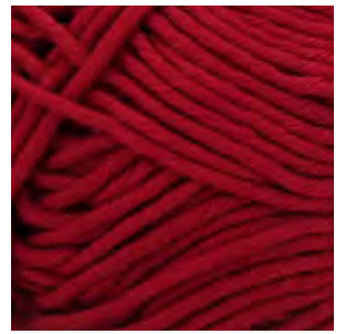
CHILLI PEPPER RED - 408