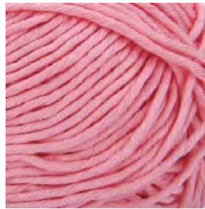
POWDER PINK - 437