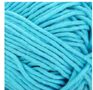
SEA BLUE - 441