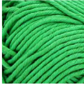
GRASS GREEN - 418