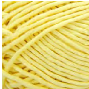
CITRON - 410