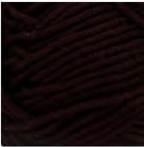
CHOCOLATE - 409