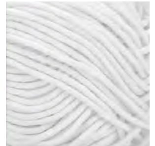
WHITE - 451