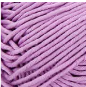
LILAC - 425