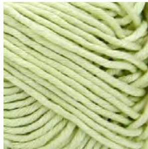
LEMONY - 424