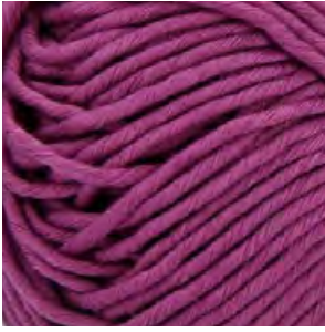
GRAPE - 417