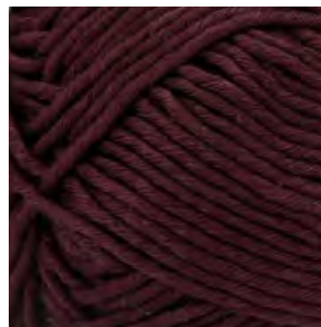
ROYAL PLUM - 440