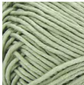
LINCOLN - 427