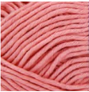
BLUSH - 405