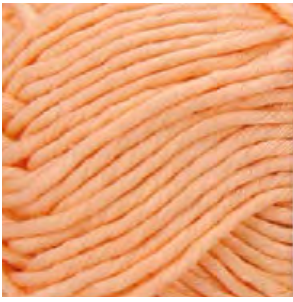
APRICOT - 401