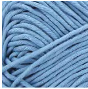
BABY BLUE - 402