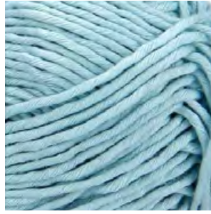
SKY BLUE - 443