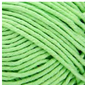
LIME GREEN - 426