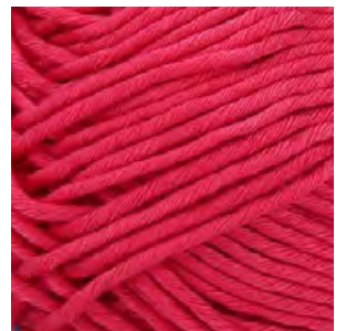
FUCHSIA - 416