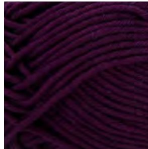
VIOLET FLOWER - 450