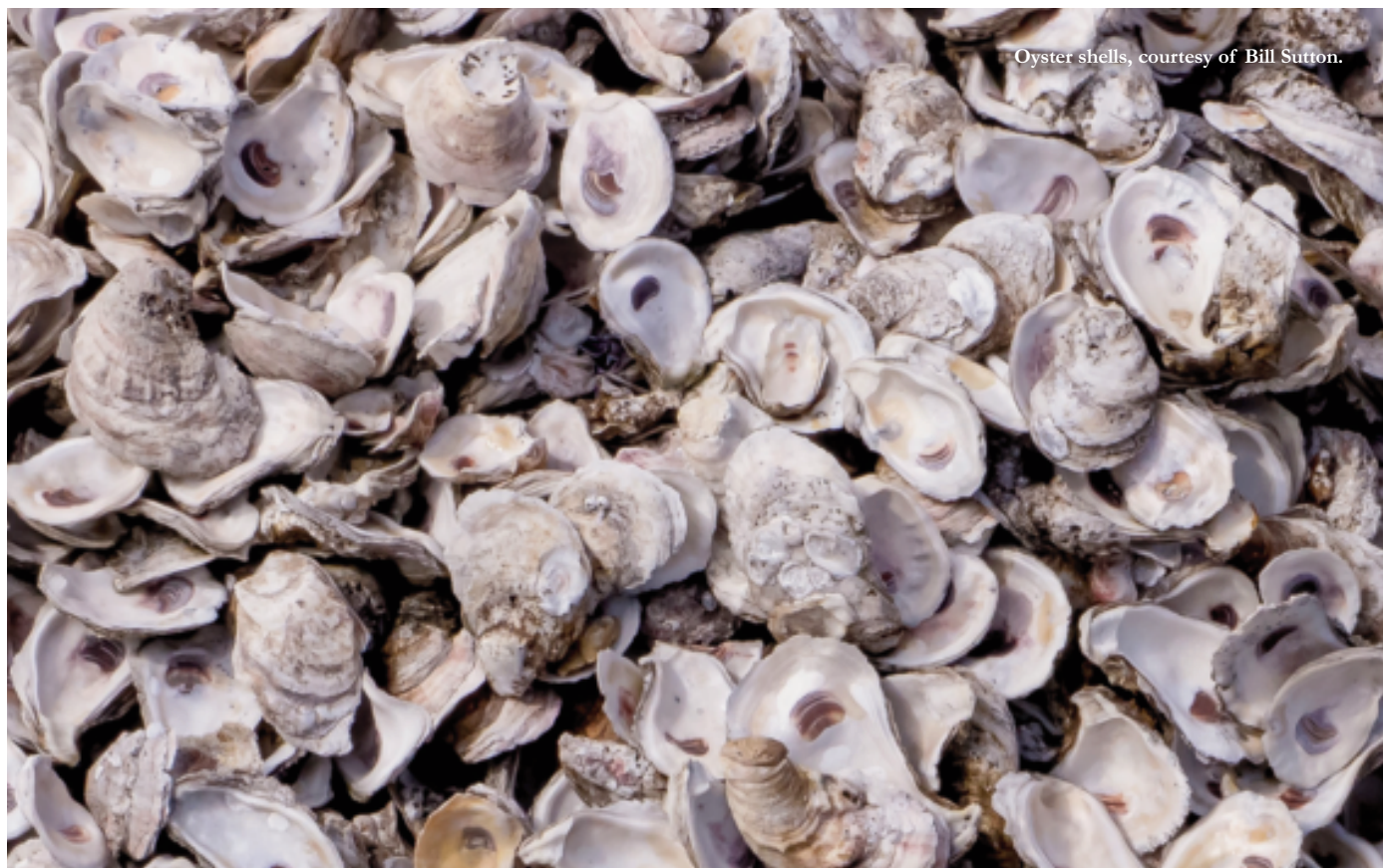
Oyster shells, courtesy of Bill Sutton.

In January 2020, several Louisiana oyster lessees sued the United States in the U.S. Court of Federal Claims. The plaintiffs alleged that the opening of the Bonnet Carré Spillway by the U.S. Army Corps of Engineers (Corps) in 2019 deprived them of the use, occupancy, and enjoyment of their oyster stock and oyster beds and reefs in violation of the Fifth Amendment Takings Clause. The government moved to dismiss the case for failure to state a claim, arguing that the oyster lessees did not have a compensable property right in the oysters themselves and that the oyster stock is owned by the State of Louisiana. After oral argument and a series of briefing on various subjects, the court determined that the oyster lessees have compensable property rights in the oyster stock and may proceed with their takings claim. 2 The opinion marks a departure from other court decisions finding that oysters are not compensable property.