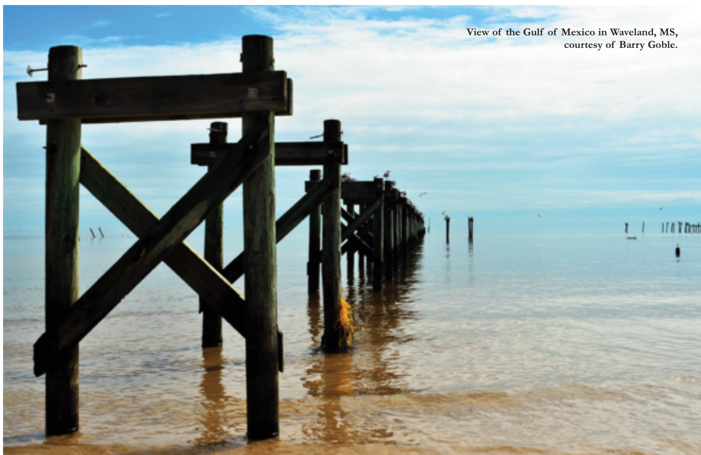
View of the Gulf of Mexico in Waveland, MS, courtesy of Barry Goble.

O n January 27th, the U.S. District Court for the District of Columbia voided Lease Sale 257, the largest oil and gas lease sale in U.S. history. 2 Lease Sale 257 was the eighth in a series of lease sales offering federal lands on the Outer Continental Shelf as part of the 2017-2022 Outer Continental Shelf Oil and Gas Leasing Program (Leasing Program). 3 The court determined that before the lease sale can go forward, the government must first conduct a more in-depth environmental analysis.