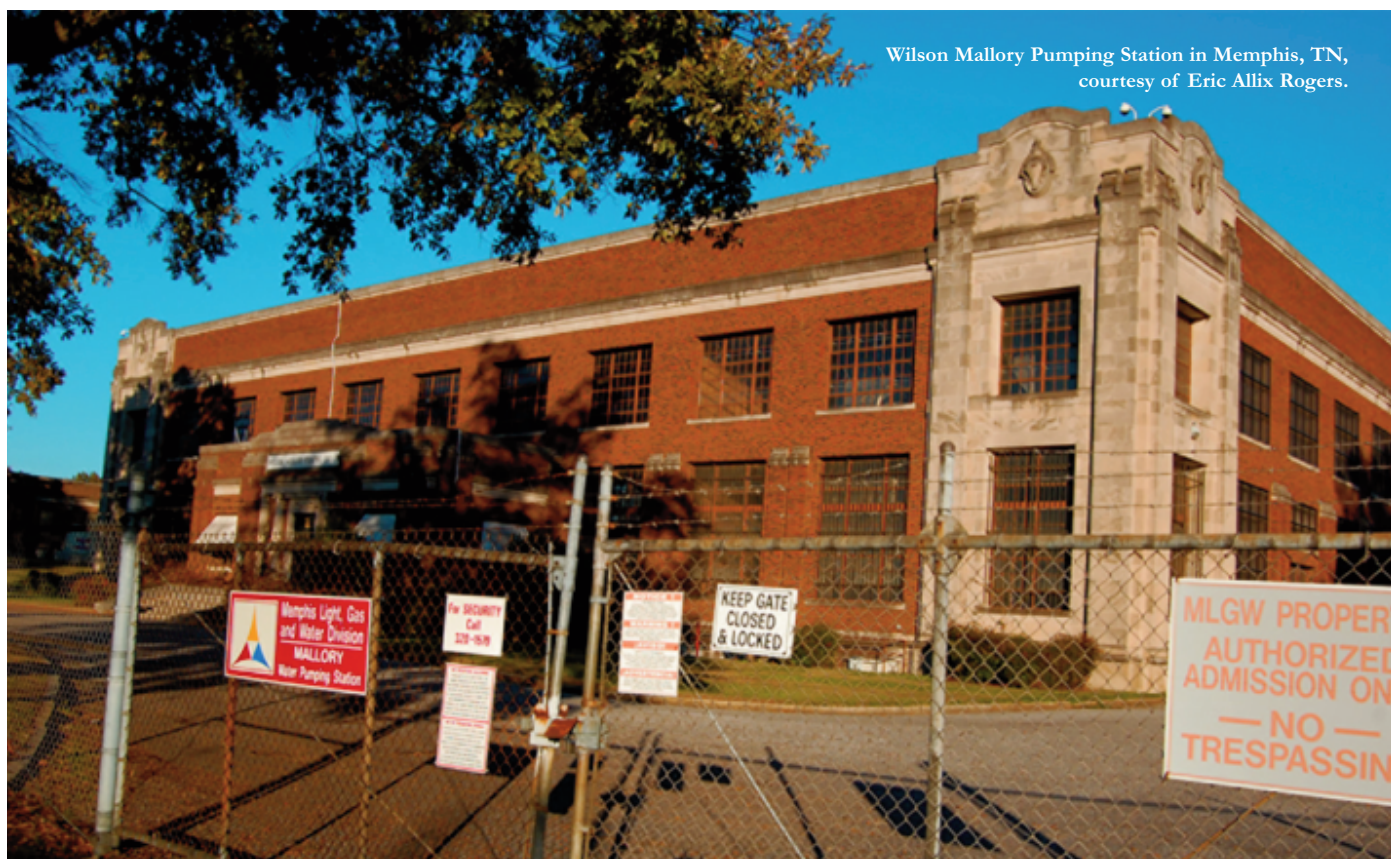
Wilson Mallory Pumping Station in Memphis, TN