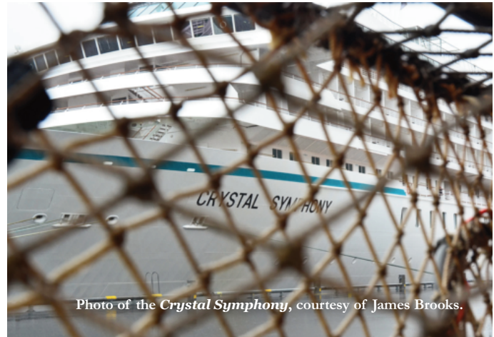
Photo of the Crystal Symphony

Not everyone affected by the unplanned detour and seizure of the ship will be able to make a claim under the ABC. Passengers aboard Crystal Symphony may be out of luck.